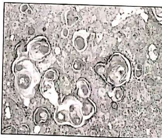
Fig 2 : Histologic section of pleomorphic adenoma. (H & E x 250)